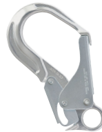
Aluminum Locking Rebar Hook