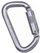
Aluminum Twist Lock Carabiner