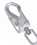
Steel Locking Swivel Snap Hook

Limitless Possibilities. Ask the Expert. Technical Service: 800.873.5242 www.millerfallprotection.com