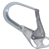
Steel Locking Rebar Hook