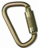
Stainless Steel Twist Lock Carabiner