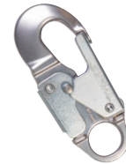
Aluminum Locking Snap Hook