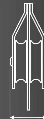
60mm (2 3/8")

These Pulleys are available in Aluminium or Stainless Steel, with Bushings or Roller Bearings. Bushings are ideal for high loads at low speeds and Roller Bearings are ideal for low loads at high speeds.