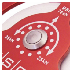
Roller Bearings Ideal for low loads at high speed

ISC Prussik Pulleys have tamper-proof Rivets, in compliance with CE EN12278 (2007) & NFPA (1983). These pulleys are available with Bushings, or Roller Bearings.