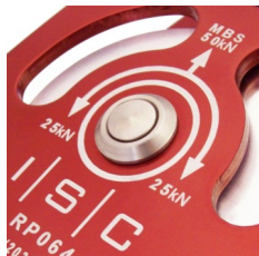
Bushings Ideal for high loads at low speed