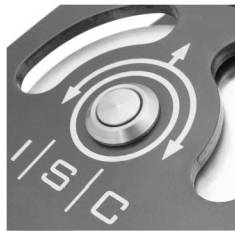
Bushings Ideal for high loads at low speed