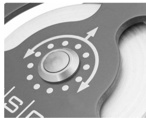
Roller Bearings Ideal for low loads at high speed

All Pulleys in our latest Heavy-duty Prussik range have tamper-proof Rivets, in compliance with CE EN12278 (2007) & NFPA (1983).