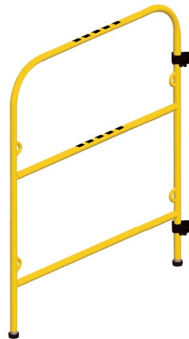
SPA2101-04 - Multi-function barricade extension