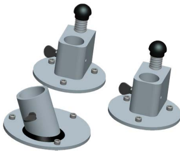
SPA2001-18 - Spiked manhole guard feet