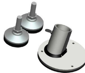
SPA2001-28 - Large Rubber feet for manhole guard