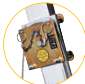
8003238 | Leg Mount Pulley Bracket for Tripod Leg