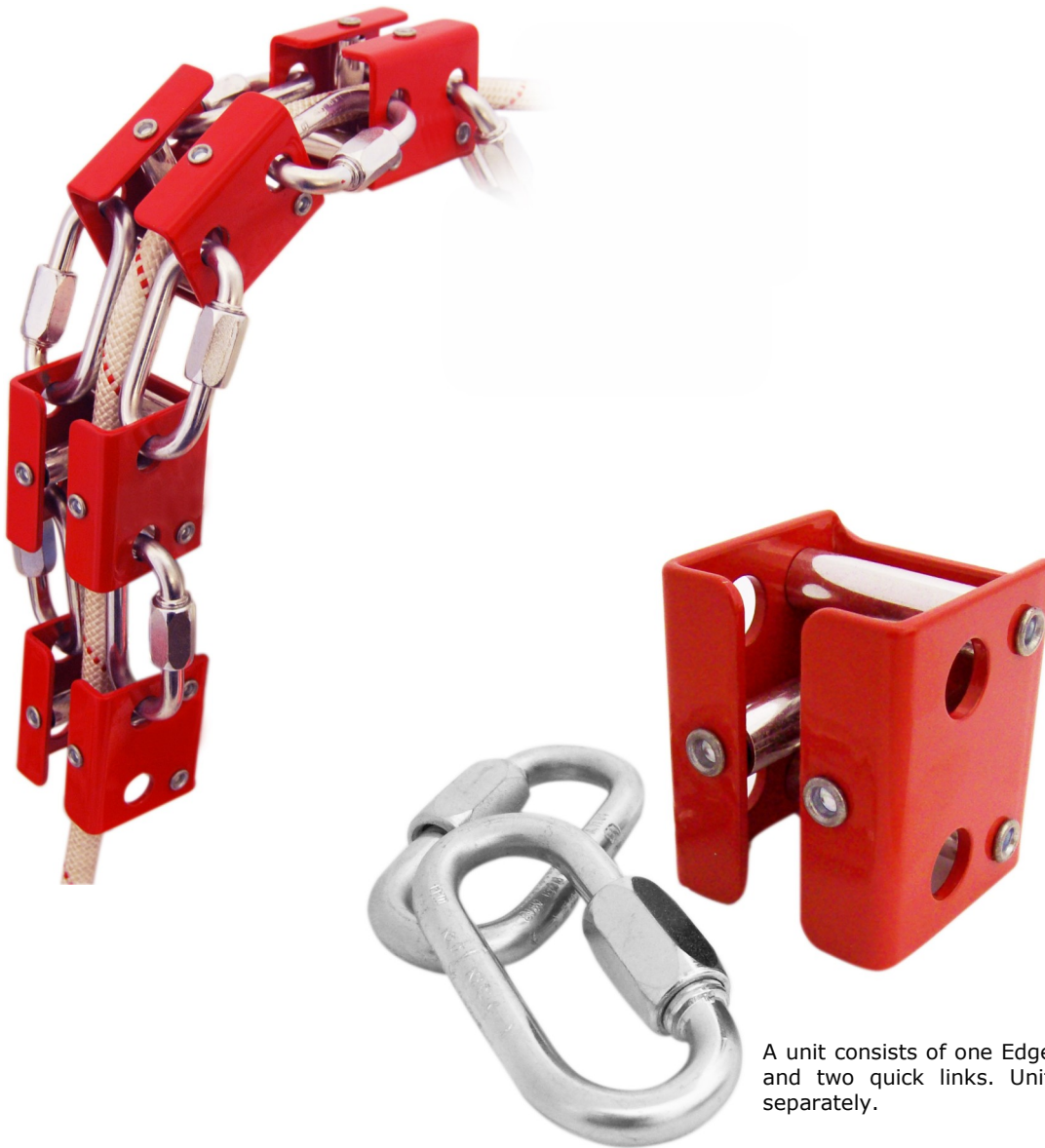
A unit consists of one Edge Roller Box and two quick links. Units are sold separately.