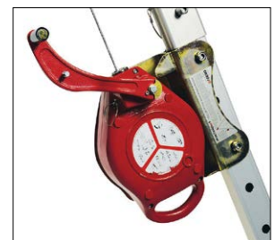
Type 3 Fall Arrestor & Mount (APOD-FA)

IndustriPOD+ available from 1 August 2018