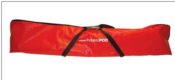
IndustriPOD® Bag (36-1019)