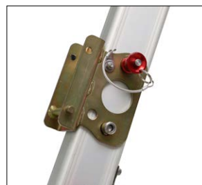
Fall Arrest Block Adaptor (APOD-FBA)