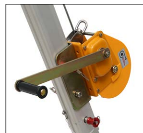
Winch and Mount (APOD-W10/W20/W25)