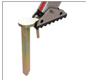
Hold Down Stake (26-2056-0)