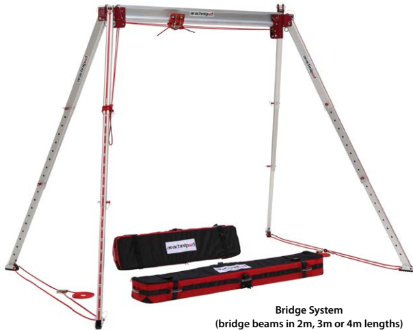
Bridge System (bridge beams in 2m, 3m or 4m lengths)