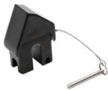
Lazy Leg Adaptor (APOD-LLA)

Included in the Advantage and Full Accessory Kits, or sold separately.