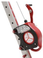
Type 3 Fall Arrest Block

Type 2 winch with mount bracket and basic wind up/down mechanism. 6mm galvanised steel cable. 10m, 20m, 25m. WLL 220kg. Sold separately.