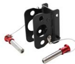
Fall Arrest Block Adaptor

Supplied with a bracket which mounts to the middle section of any supporting leg. 15m length. WLL 136kg / 300lb Sold separately.