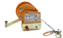
Winch with Cable (APOD-W*)

Included in the Full Accessory Kit, or sold separately.