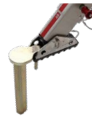
Hold Down Stake (16-1046-0)

Included in the Full Accessory Kit, or sold separately.