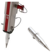
Spike Foot (90-0120)

Extension kits are pre-assembled components designed to expand the capabilities of your Arachnipod.