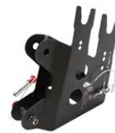
I.K. Fall Arrest Block Adaptor

This adaptor enables SALA Type 3 fall arrest blocks, Pelsue winches, Karam PN818DP and other similar-shaped blocks to be attached to an Arachnipod leg. Sold separately.