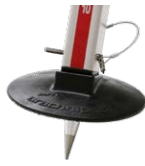
Soft Ground Shoe (34-0032)

Included in the Advantage and Full Accessory Kits, or sold separately.